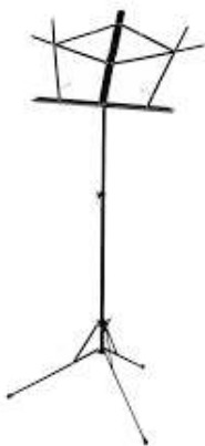
Wire Music Stand for home practice