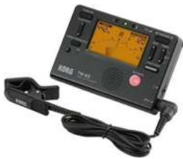
Korg TM60 Metronome/Tuner Combo with clip on microphone

Hetman's Synthetic Piston Lubricant #2 Valve Oil (Preferred) or Monster Oil if Hetman's is unavailable